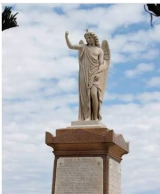
Her memorial at Waverley Cemetery