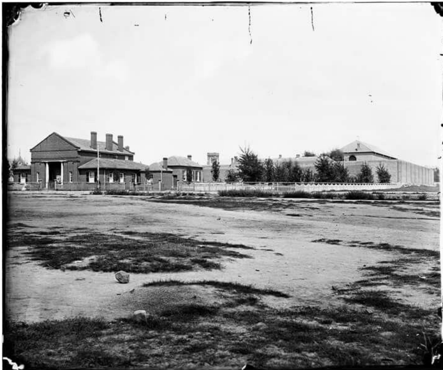
The old Court House, the Watch House and Gaol at Bathurst in New South Wales in the 1870s.

References: Edgar Penzig; Frank Gardiner- the bushranger; NSW State Archives; Trove; Pinterest.