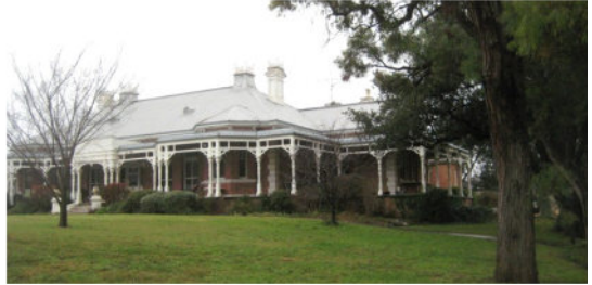
Coombing Park, 2012. Was also the location for Bryce Courtenay's movie of 'Jessica'