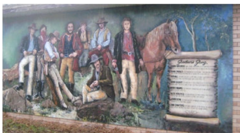
Gardiner's Gang: mural painted on wall at Eugowra, 2012