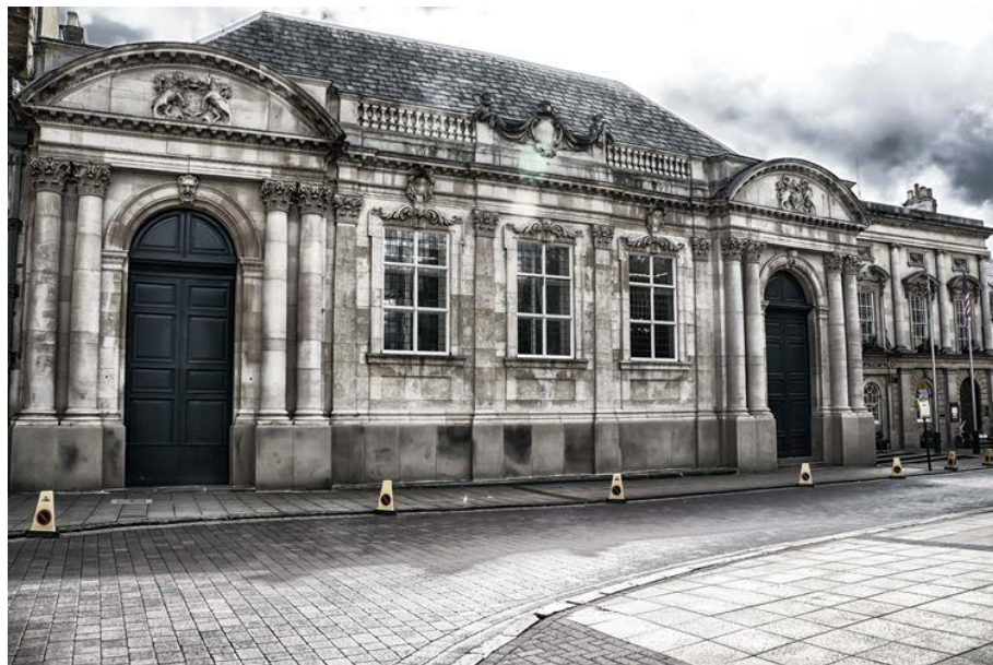
Sessions House (Courthouse) Northampton, England.