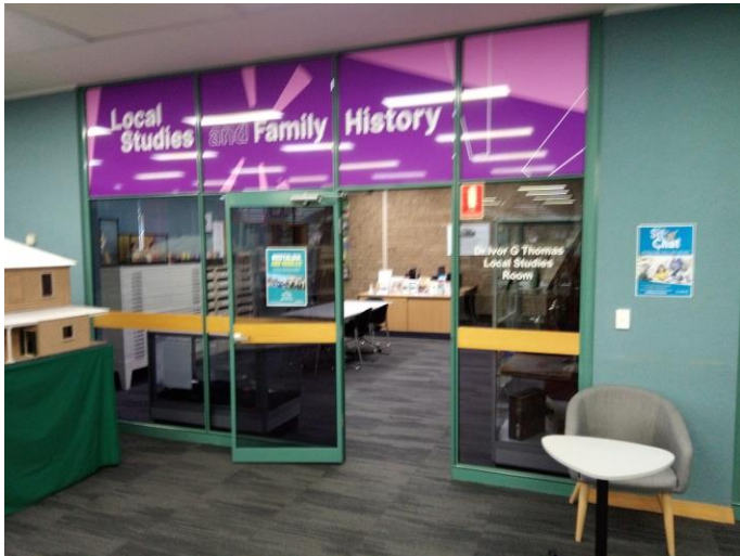
The New Family History Room at Campbelltown Library.