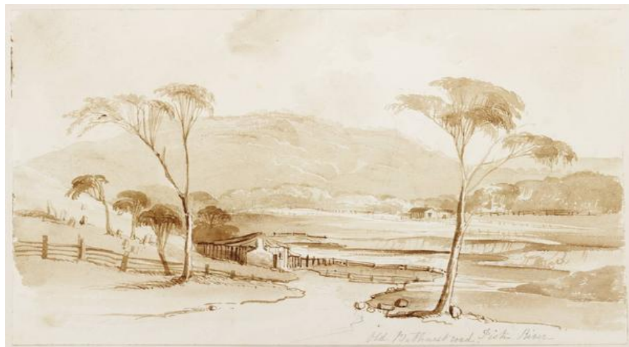
Old Bathurst Road and the Fish River.