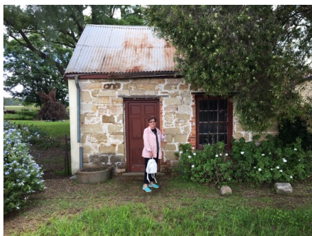
Illustration 2: Maitland Cottage