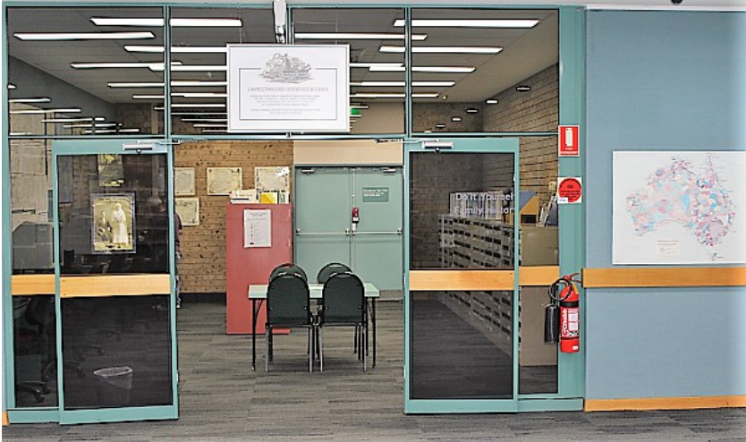
The Family History Room at Campbelltown Library.