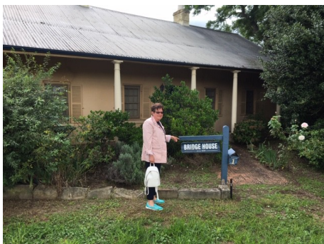
Illustration 1: Clift Home, Bridge House