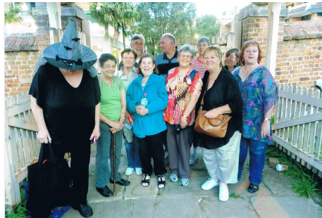
Whispering Bones Tour.